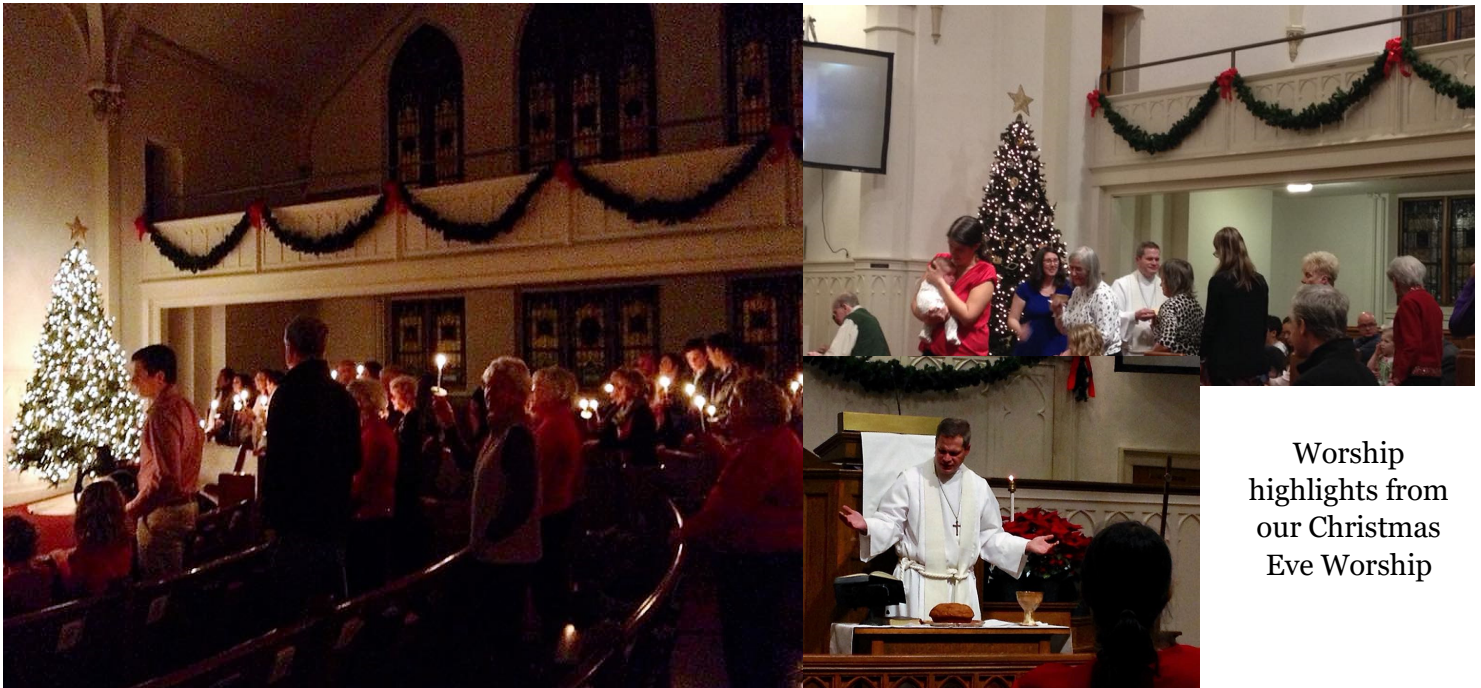
Worship highlights from our Christmas Eve Worship

College Place United Methodist Church 509 Tate St. Greensboro, NC 27403 336-275-3363 collegeplaceumc.com