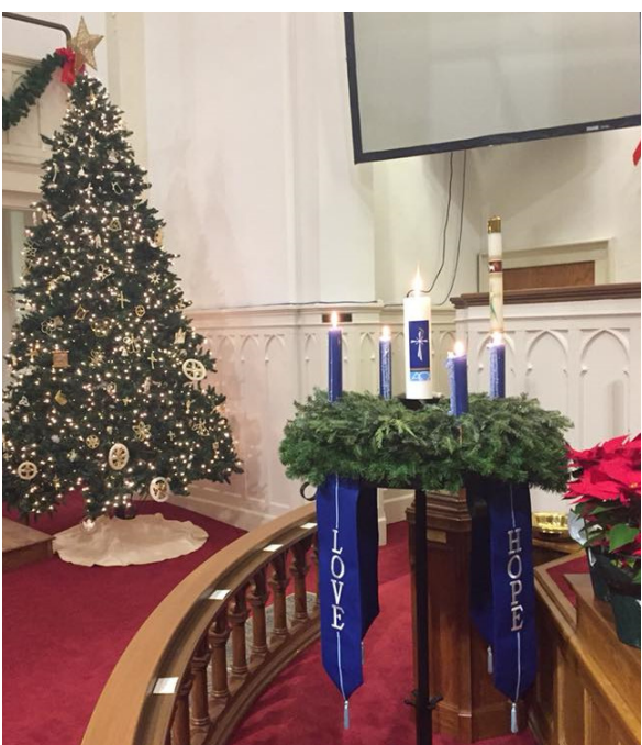
Merry Christmas! May 2018 be a great year!

We are almost to our goal of $1,500! We have received a total of $1,150.76 towards our goal which will be used to purchase the "Joy to the World" gift basket which includes two sheep, four goats, one heifer and two llamas. You may still make donations toward this project, even a donation in honor or in memory of someone, please make checks to College Place and note Heifer on the memo line.